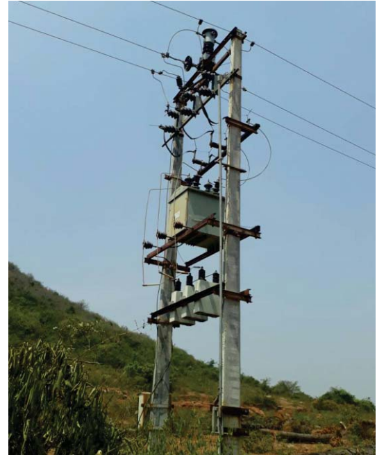
714 Kvar, 12 Kv External Fuse, Pole Mounted Capacitor Bank